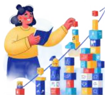
Building Tiny Habits