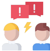
Perfectionism & Self-Doubt