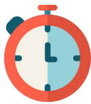
Long Working Hours