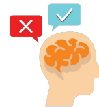
Inner Pressure & Self-Criticism