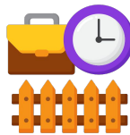
Blurred Boundaries Between Work & Life